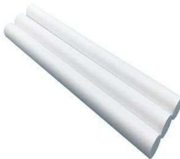
Boron Nitride Tube