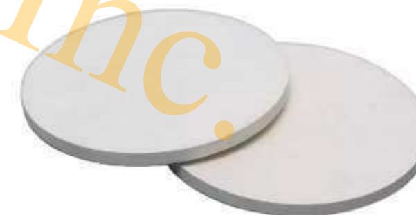
Boron Nitride Plate/Sheet/Disc