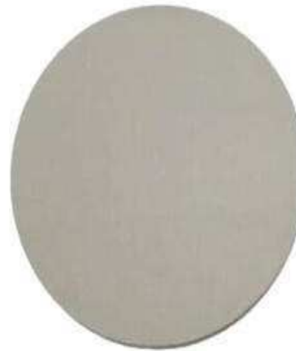
AlN Sputtering Target