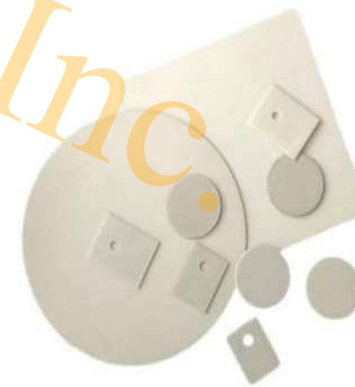
Aluminum Nitride Substrate