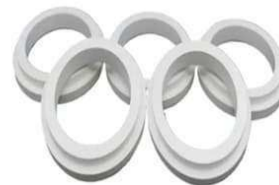
Boron Nitride Ring