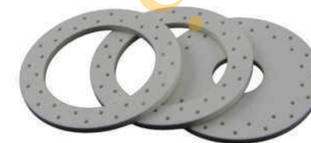
Pyrolytic Boron Nitride Ring