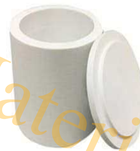
Boron Nitride Crucible