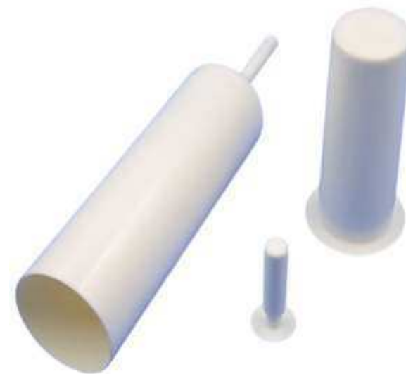
Pyrolytic Boron Nitride Crucible