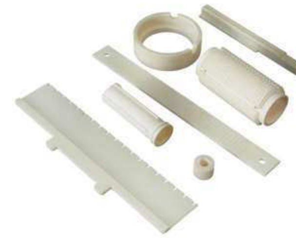
Alumina Custom Parts