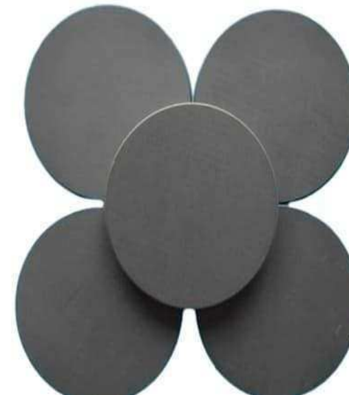
Silicon Carbide Disc