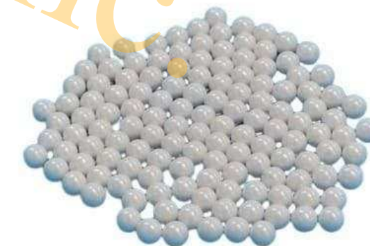
Zirconia Ceramic Ball