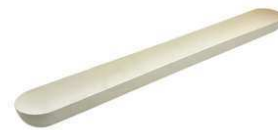
Pyrolytic Boron Nitride Boat