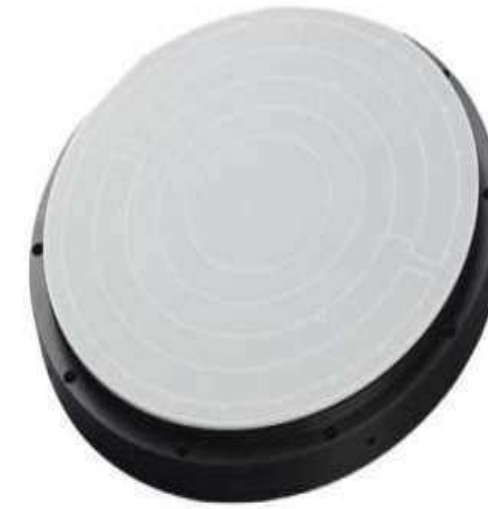
AlN Electrostatic Chuck