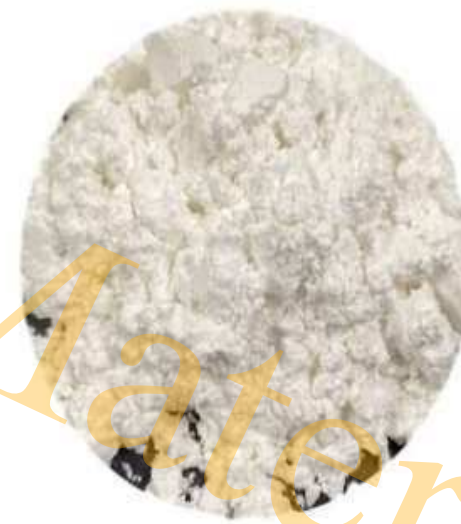
AlN Surface Modification Powder