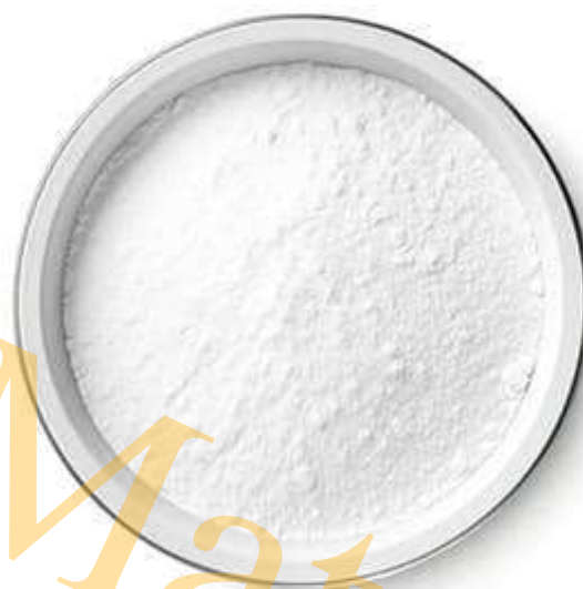
Boron Nitride Spherical Powder