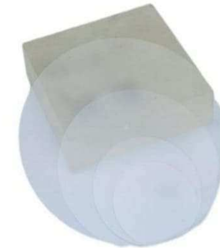
Fused Quartz Wafer